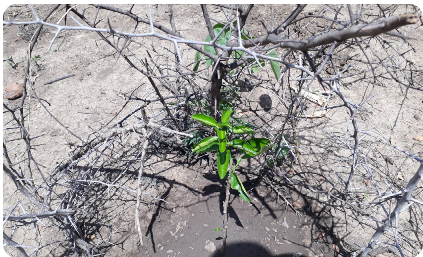
Tree protected using FMNR techniques

Cash-for-work and sustainability: During the FMNR assessment, only a few respondents said they adopted FMNR to address drought. Many participants reported that they practiced this technique to receive money through CFW. Although ongoing CFW incentive is unsustainable in the long-term, it was seen as an essential factor to build initial interest and uptake, with the aim that longer term benefits will incentivize ongoing FMNR practices and site maintenance. Evidence around the possible influence of these longer term incentives on future site management is not available, but would be a useful line of inquiry in future programs.