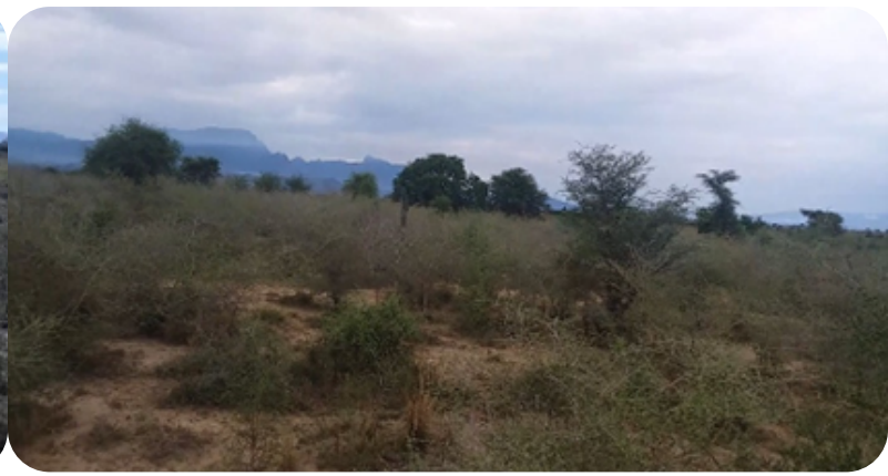
Loboloin FMNR site in April 2020 and March 2023, Loregae sub-county, Nakapiripirit District

increased access to food resources from both trees (wild fruits and leaves) and wildlife, as well as fodder for livestock that browse leaves and acacia pods during the dry season. Respondents reported that trees also provide fuel, fencing, and building materials for communities, using the branches gathered through pruning and tree maintenance. District Forest Officers and sub-county officials in the four districts also reported increased biodiversity at the FMNR sites compared to non-protected areas.